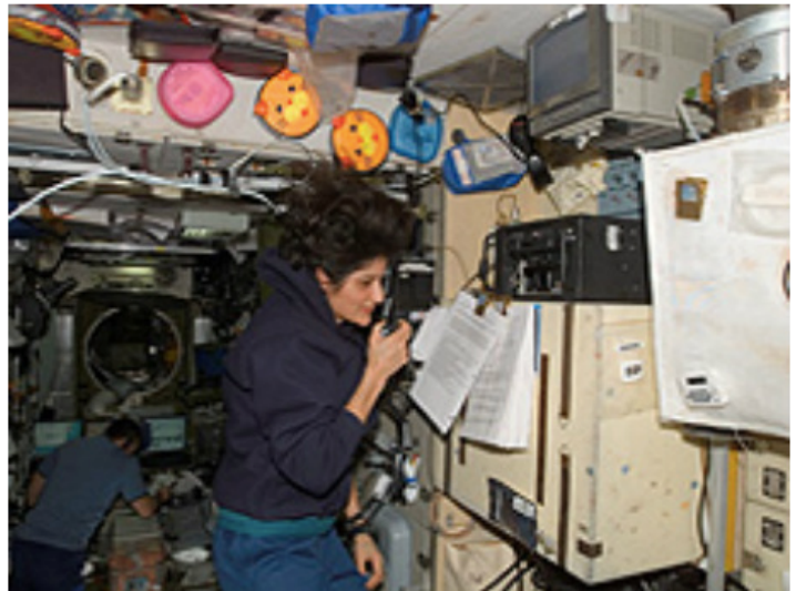
Astronaut Sunita Williams. KD5PLB, speaks to students during a school contact.

The library would be assuming responsibility for the majority of the aspects of the event - the facilities, PR, distributing sound and video, accommodations, involvement of schools and youth groups, and pretty much all logistics. The CARC's responsibility would be making the radio contact happen and handing off audio feeds to TADL's crew for distribution to the audio and video feeds. The library produced, completed and submitted the Education Plan. The Cherryland ARC and ARISS Mentors completed and submitted the Equipment Plan.