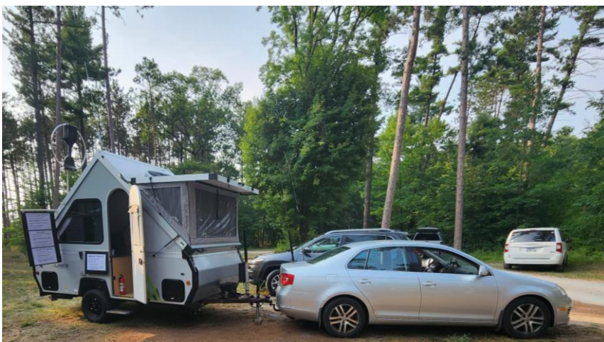
WA8LMF “Studio B” A-Frame station