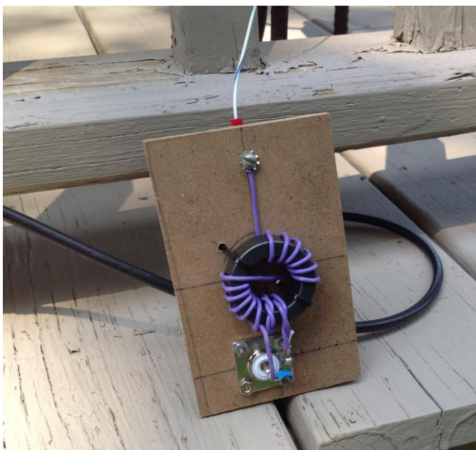
The 49:1 coupler hastily built for testing

The porch railing gave me enough running room for a half wave antenna on 20 meters. Good enough for a test. I tucked 33 feet of light gauge wire underneath the top rail to run as an end-fed half wave radiator. I ordered a kit of parts from eBay for $10 plus $6 shipping to construct a 49:1 toroid coupler to make the transition from the very high impedance of the antenna to traditional 50 ohm coax cable. A short run of coax into the house and I was done.