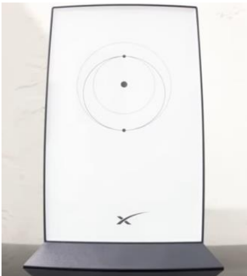
Starlink Router (below)

It is a great honor to announce that the Cherryland Electric Cooperative has donated $1500.00 for the TBARG Starlink Project. This is a one time donation to get the program started. Starlink is a satellite based internet system that will supply high data bandwidth needs in the event of a local/regional internet or cellular disruption. TBARG will be working with Northern Michigan first responders (Grand Traverse Emergency Management, police, fire, airport, Munson Medical Center, and many others). As we have learned from 9/11 and Katrina, communication is an essential component in disaster management.