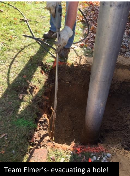
Team Elmer's- evacuating a hole!

Wow, I'm never going to hand dig another tower base again!