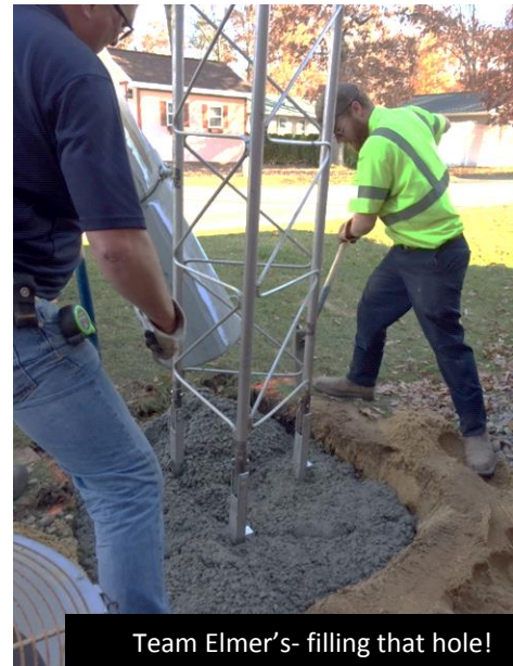
Team Elmer's- filling that hole!