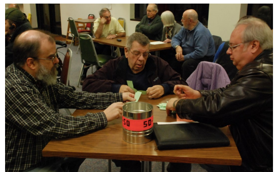
Election Ballot Counting, 2013